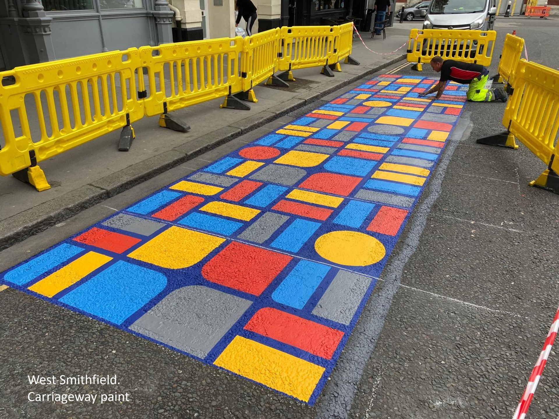
West Smithfield. Carriageway paint