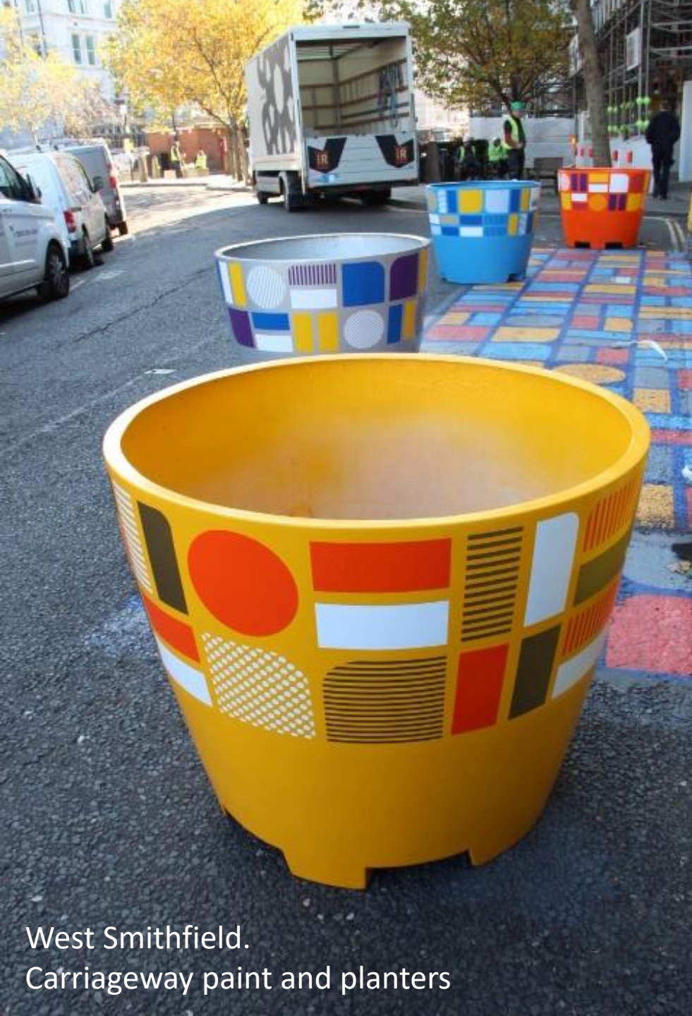
West Smithfield. Carriageway paint and planters